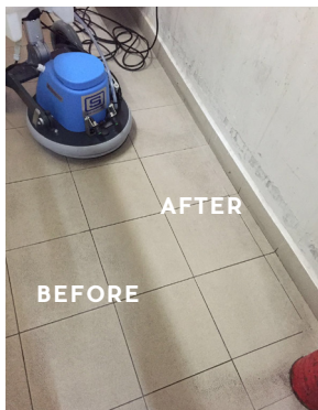
Flooring with grouting