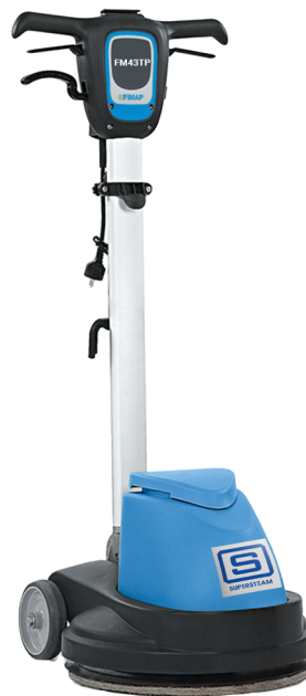
FIMAP Orbital Basic