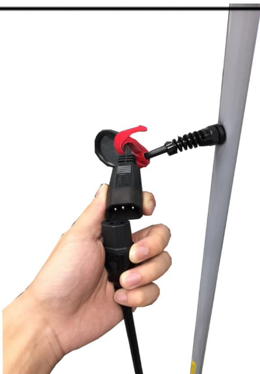
CONNECT PLUG 链接两个插头