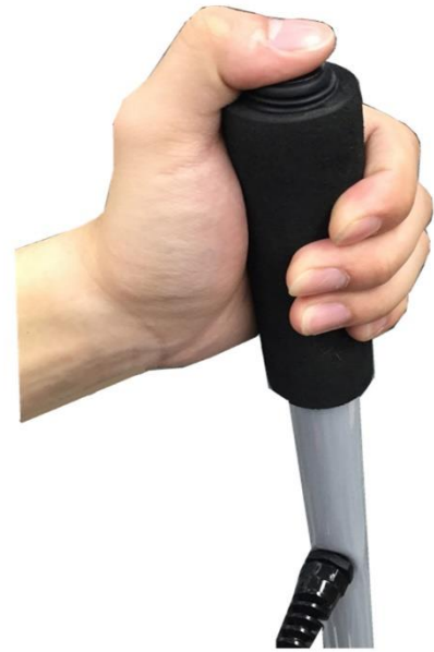
PRESS TO SWITCH ON 按下按钮