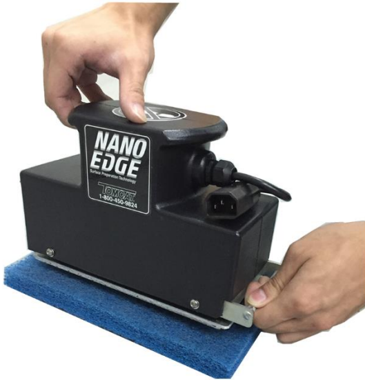
ATTACH SCRUBBING PAD 放置机器