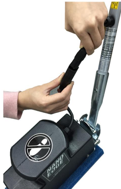
CONNECT PLUG 链接两个插头