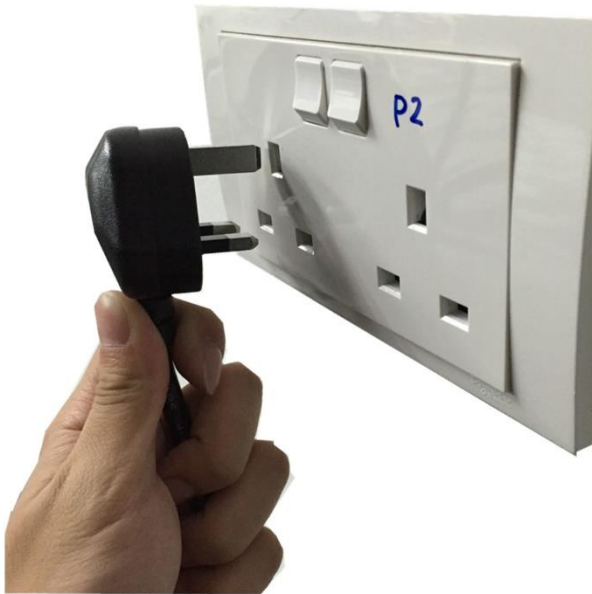
INSERT POWER PLUG 插入电源