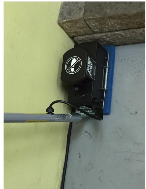
PERFECT FOR CONNERS 适合角落