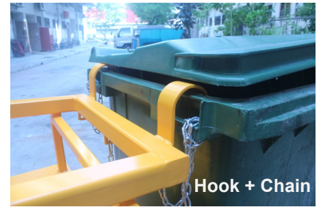
Integrated Tow Hook (Factory Fitted) Tow with hook, chain or both!