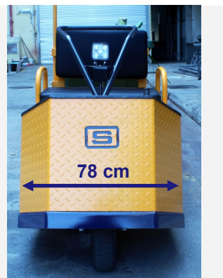
Wide body for lower CG and thus better stability!