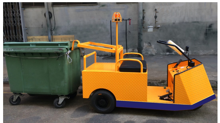
Fits most bin designs in Singapore