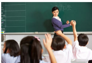
Schools / Colleges