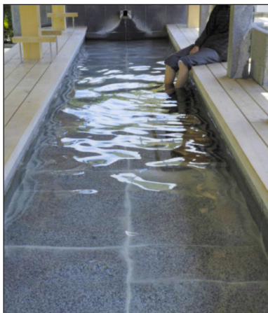
Suitable for Factory Foot Baths