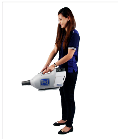
Suitable for Fogging Machines