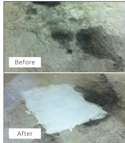
Effective and instant results