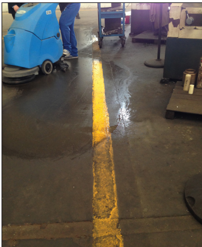
Can be used in workshops, factories and warehouses with thick grime